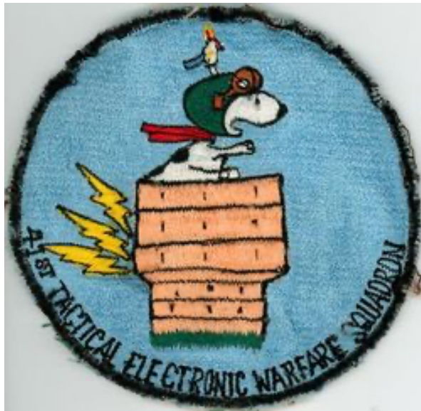
41 Tactical Electronic Warfare Squadron patch