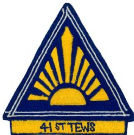
41 Tactical Electronic Warfare Squadron patches: On a Medium Blue disc edged Black a Blue equilateral triangle charged with a Yellow demi-sun emitting thirteen rays, all within a Black band formed by three chain links highlighted White.