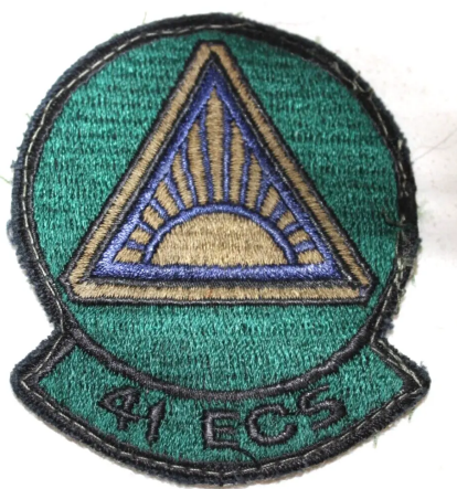
41 Electronic Combat Squadron emblem: On a disc Celeste, on an equilateral triangle Sable, inner border on each segment a single chain link Argent, a field Azure, charged with a demi-sun